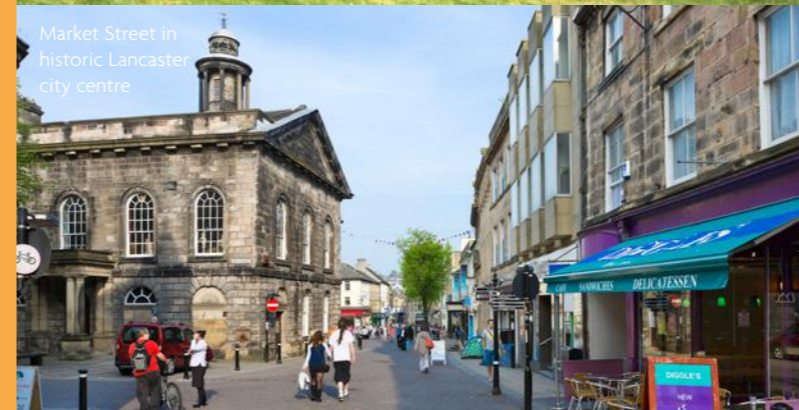
Market Street in historic Lancaster city centre