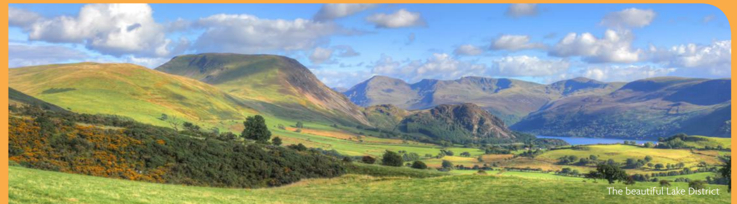
The beautiful Lake District