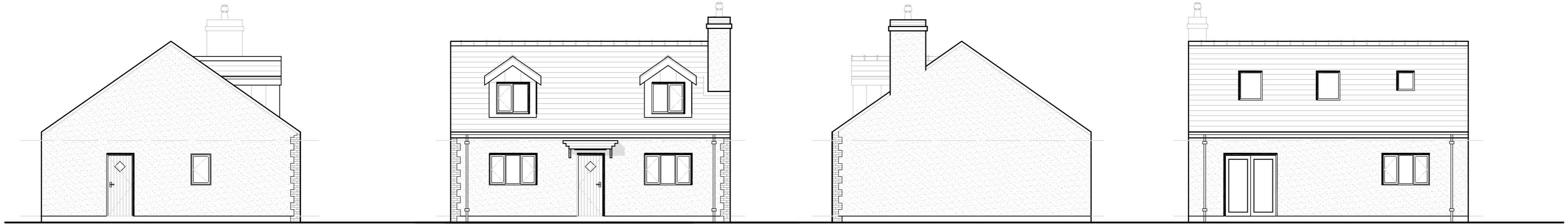
South West Elevation Unit 2 1:100 Scale

This drawing is to be read in conjunction with all relevant Architect, consultant, specialists' and sub-contractors drawings and specifications. The Architect is to be notified of any discrepancies before proceeding. Do not scale from this drawing. All dimensions and levels are to be checked on site. This drawing is subject to copyright. All work carried out before Building and Planning Permission has been granted is at the contractor/clients own risk.